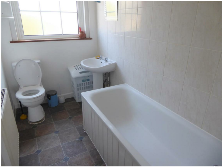
White suite comprising enclosed bath with mixer tap, pedestal wash hand basin, low level w.c, double glazed window.